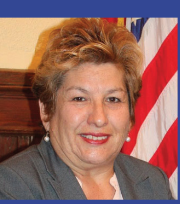
Maria Orozco Mayor of Gonzales